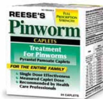
Dose or as a measured caplet dose

Reese's Pinworm Medicine is the most cost-effective way to treat a pinworm infection; since it's available OTC, it doesn't require a prescription. Even if a patient has health insurance, Reese's Pinworm Medicine is less expensive than a prescription treatment when you factor in both the doctor's office visit and prescription co-payments.